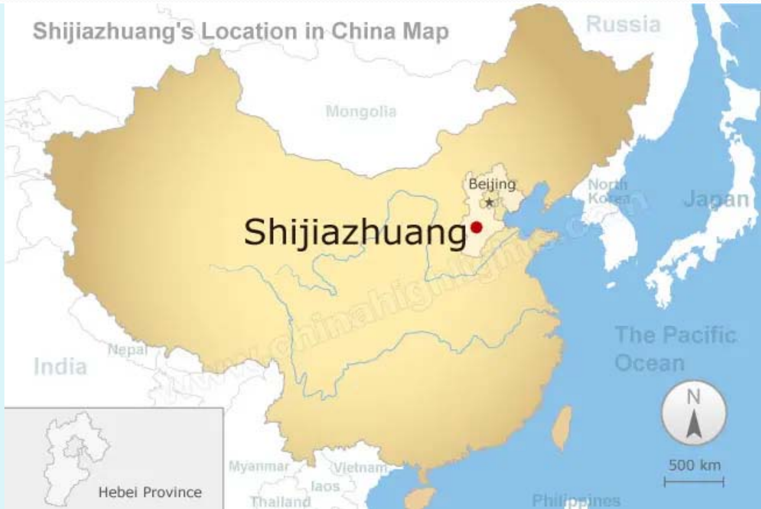
Shijiazhuang's Location in China Map